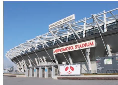
AJINOMOTO STADIUM (TOKYO STADIUM)

must-visit sights include the AJINOMOTO STADIUM (TOKYO STADIUM) and the Musashino Forest Sport Plaza which are venues for the Rugby World Cup 2019 Japan Tournament, and the 2020 Tokyo Olympic and Paralympic Games and Jindaiji-temple, one of the most famous and ancient Buddhist temples in the Kanto region, where you can find a Buddha statue designated as a National Treasure and enjoy soba noodles in the surrounding area.